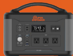
Powerplay Portable Power Bank 600W | 1000W | 1500W