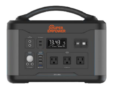
Powerplay Portable Power Bank 600W I 1000W I 1500W